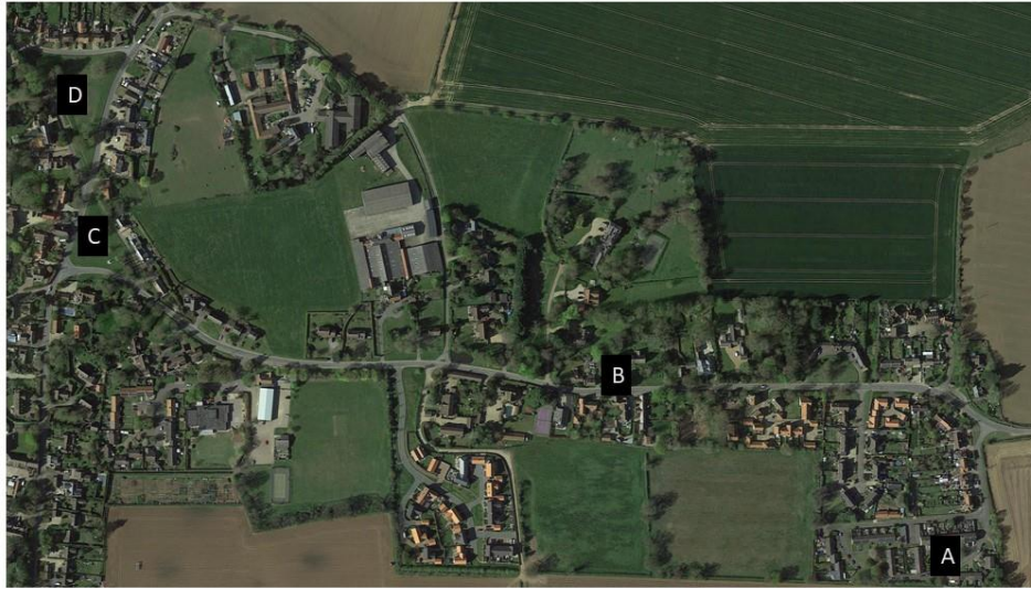
Fig. 1. Map of Risby with Locations of Proposed Sites